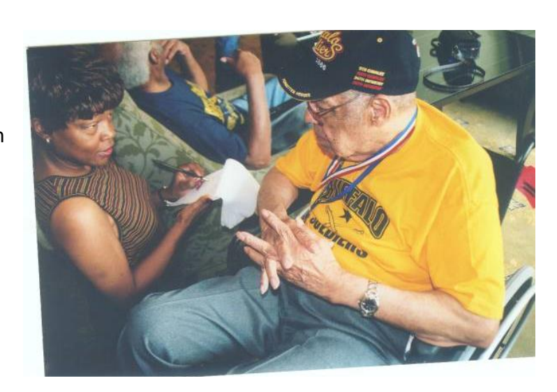
We had a grand time! Many of these soldiers are no longer with us but their stories must be saved for future generations.